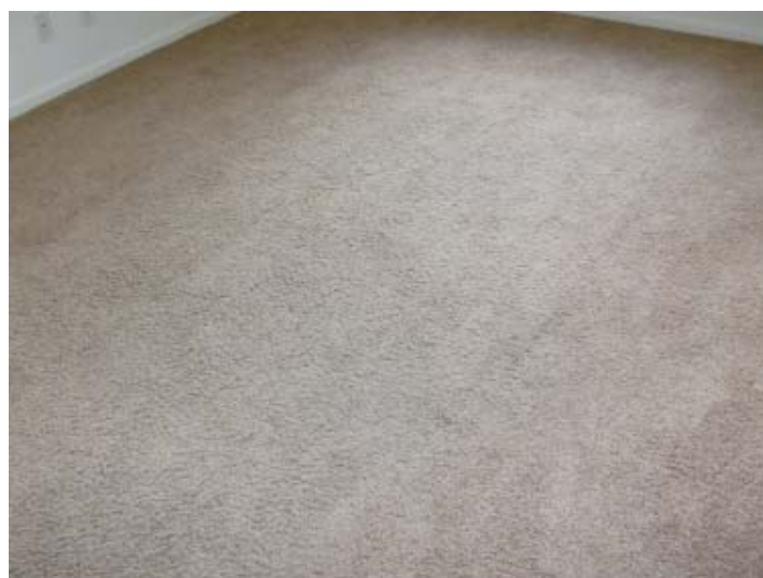
Bedroom (3) On left